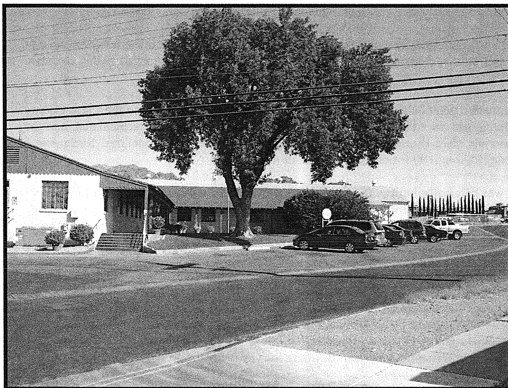
Date Street Building 100-Pre-construction