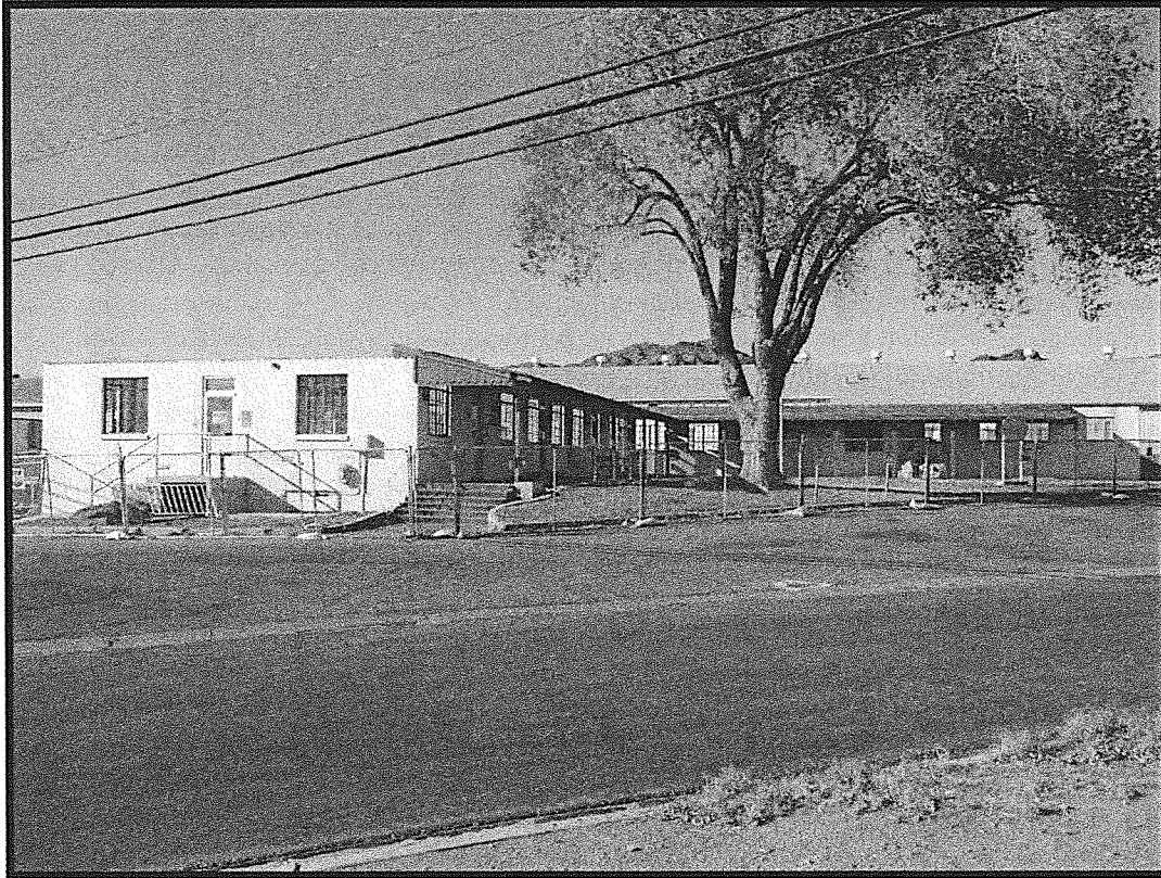
Date Street Building 100-Current Status