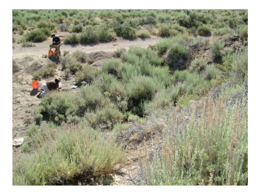
Photo 2: Excavating worker bunkhouse

Excavation focused on the section foreman's dwelling and privy, as well as the trackmen's bunkhouse. At the section foreman's compound, fourteen 1x2 meter units were excavated both within the boundaries of the foreman's dwelling and in the compound surrounding the structure. A root cellar with intact wooden floor and walls was uncovered which yielded finds such as faunal remains, food related utensils and vessels, clothing items. Also documented were landscape and architectural remains such as fence posts, tree locations, plumbing, and house foundations. A number of artifacts relating to the section foreman's wife and children were also recovered.