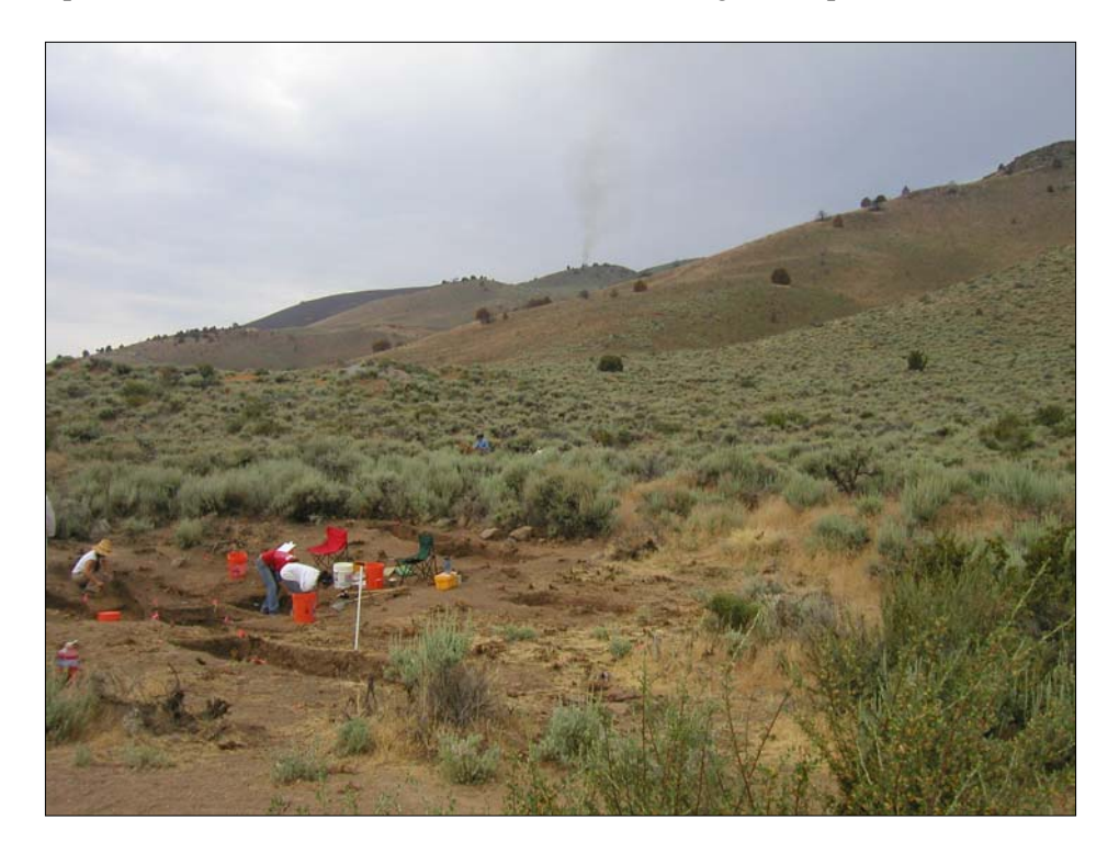
Photo 1: Overview of field school students excavating root cellar of section foreman's house