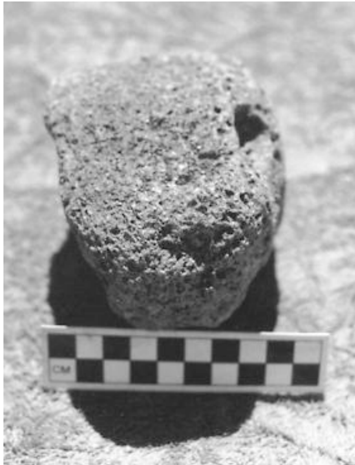
Figure 3. View of the top/front of the effigy.