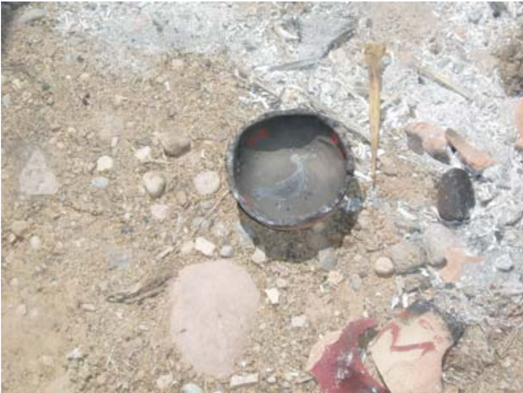
Seen here is a bee weed design on an unexploded pot adjacent to red ochre design on one that didn't make it.