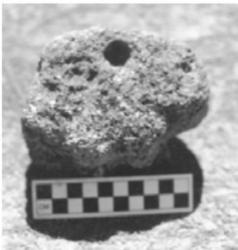
Figure 1. The right side of the effigy.