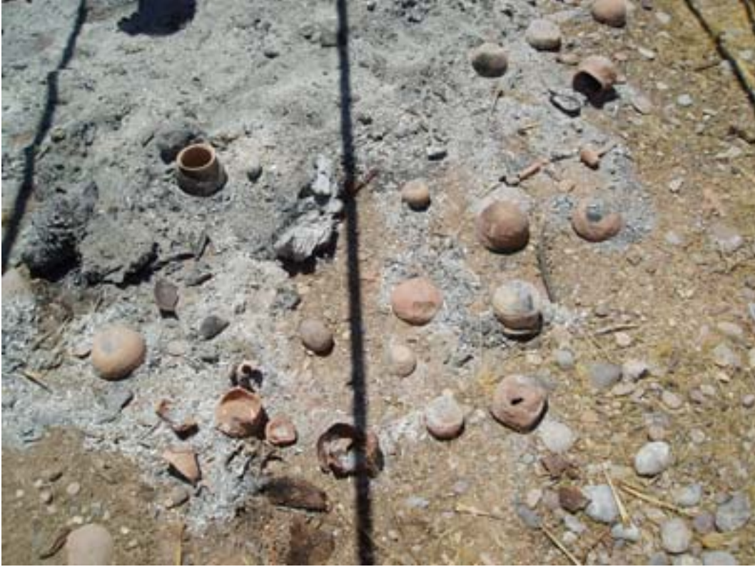
Exploded and, most importantly, un-exploded pots!