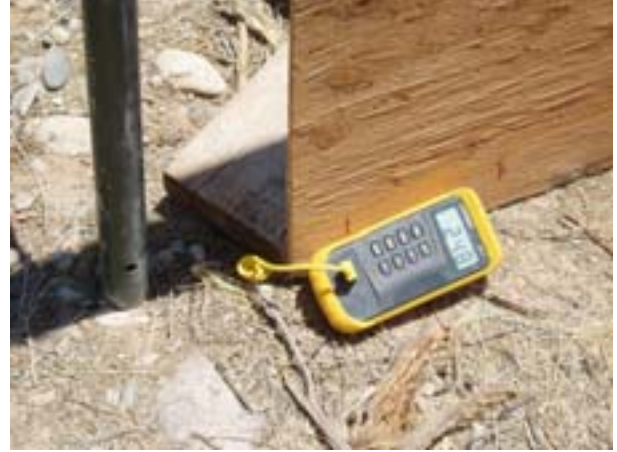
A thermocouple recording the temperature of the fire. That's degrees Centigrade—hot, hot, hot!