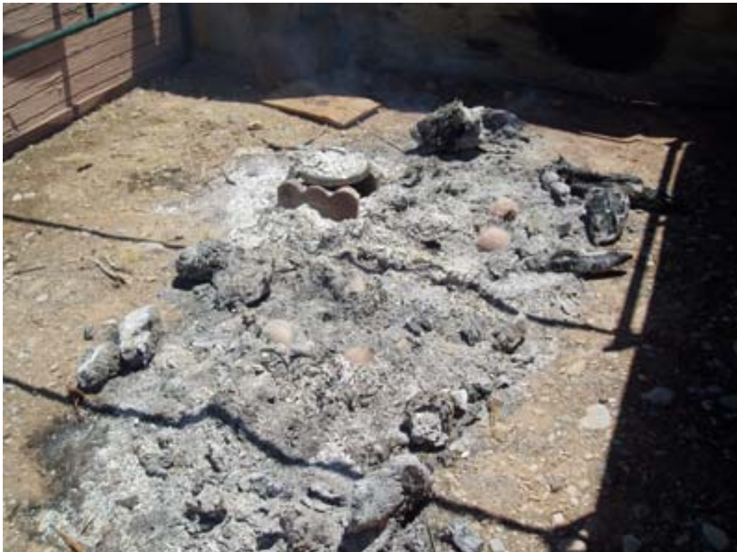
Pots are becoming visible after the fire has died down.