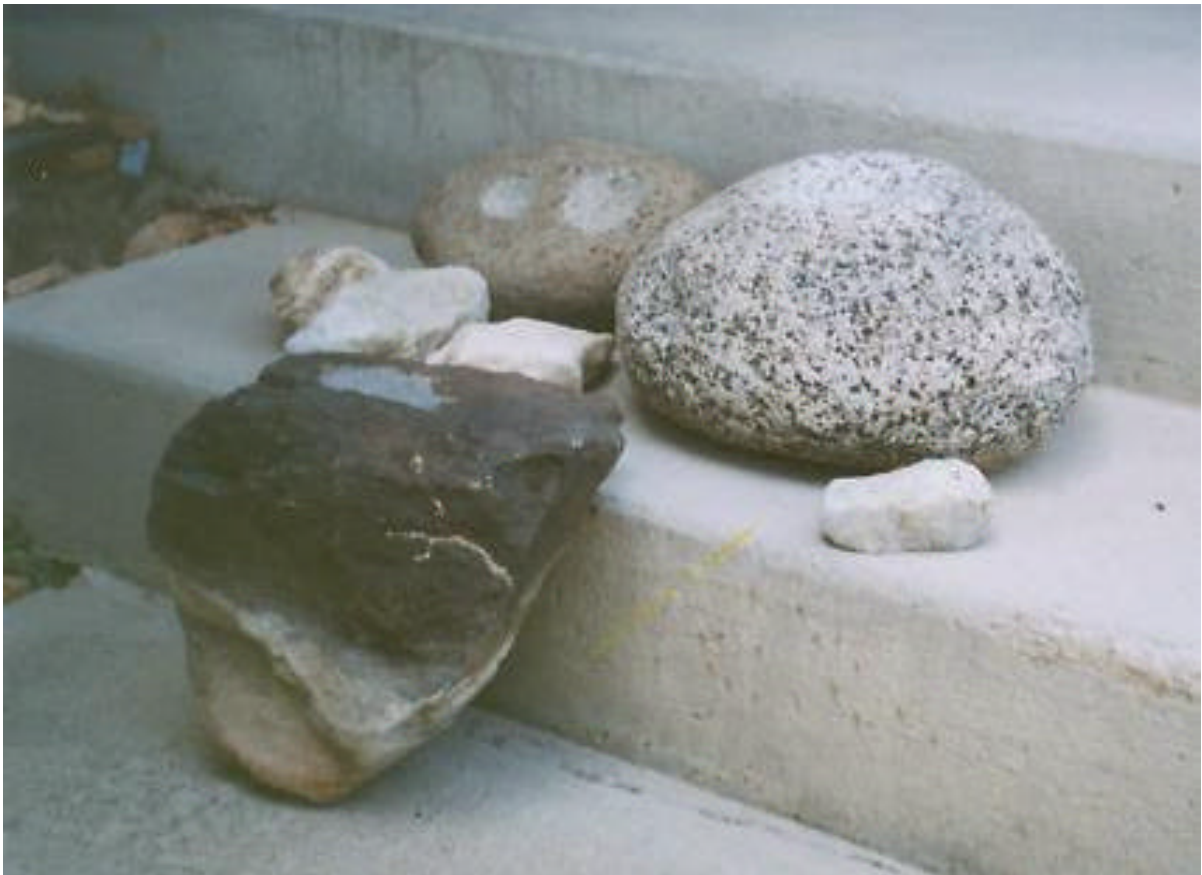
Replica cupules made by Oyvind Frock.

WHO KNOWS?? Why not give it a try and come to your own conclusions?