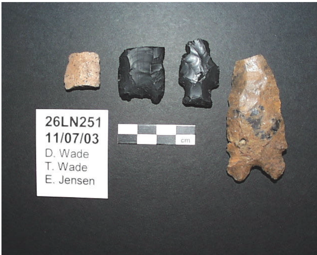
Points collected from 26LN251.