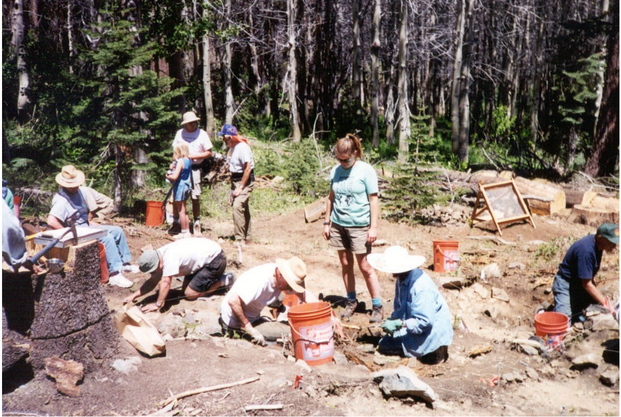
The Forest Service's PIT crew excavating the Bliss Peak Chinese dwelling.