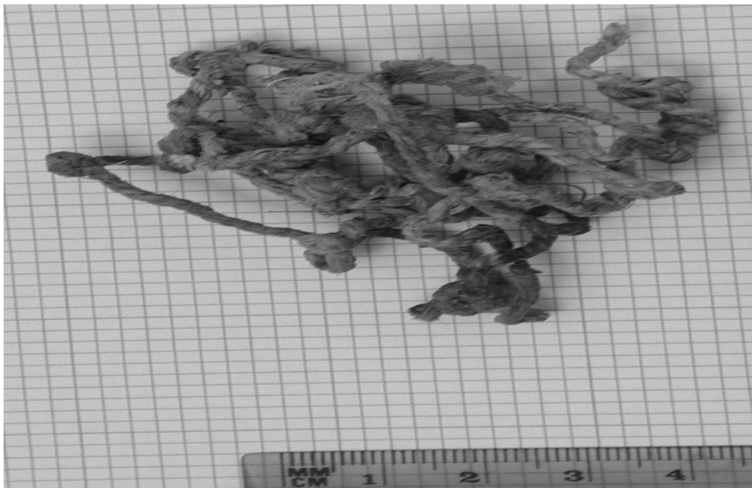
Figure 3. Cordage recovered with the five triggers.