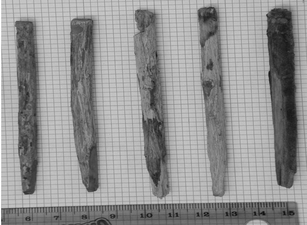
Figure 2. Deadfall triggers from rockshelter, Wildcat Canyon.